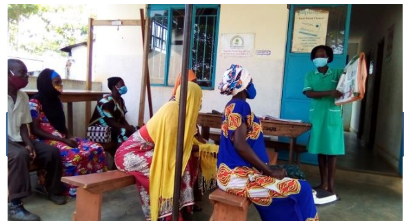
Health worker sensitizing pregnant women