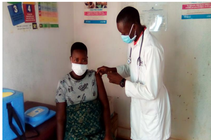
Staff attendance to patient during COVID 19

During the first wave of COVID 19 in Uganda. The four staff of Kagumu health center III was infected with COVID 19. The rest of the staff abandoned work and patients started practicing self-medication putting them at great risk to drug side effects. However, when funding was realized and procured personal protective gears, health workers gained confidence and resumed working without fear.