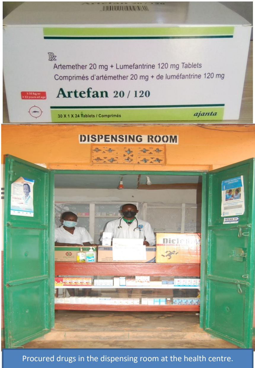
Procured drugs in the dispensing room at the health centre.