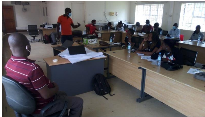
STAKEHOLDERS IN AN INCEPTION MEETING

A one day project inception meeting of 35 participants was conducted. The meeting comprised of Sub County and district local leaders, staff, and sub county COVID 19 taskforce members and religious leaders. In the meeting, participants were oriented on the project goal, Objectives, activities and this increased their understanding of the project implementation arrangement, harmonization of the project activities into the Sub County and district plans and enhanced project ownership and sustainability.