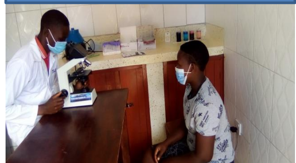
Conducting malaria test